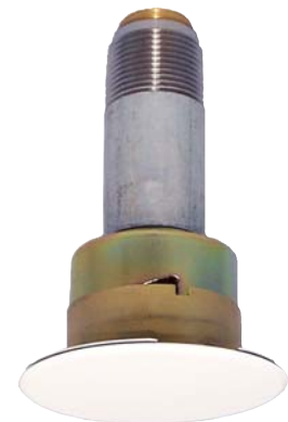
QUICK RESPONSE WHITE DRY CONCEALED PENDENT